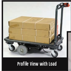
Profile View with Load