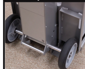
Kick axle for easy tilting of load transport