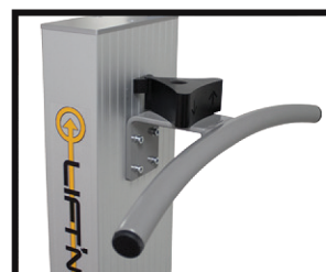
Ergonomic handle with lifting and lowering thumb switch