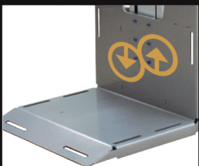
Large 20" x 16" platform with load backrest and angled lip