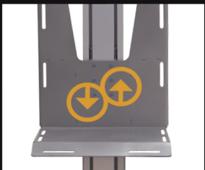
Platform slots for securing loads with bungees or straps