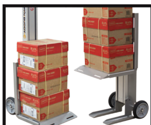
Base legs allow unit to stand even when raised under load