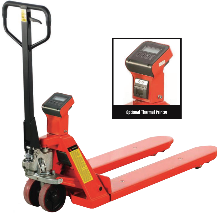
Optional Thermal Printer