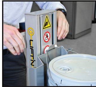
Pail retainer keeps loads secure