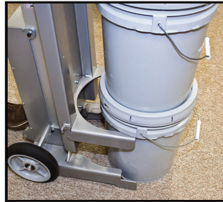
Lifting yoke holds pails in place