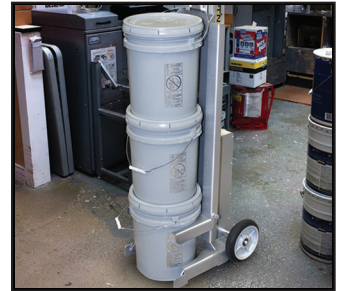
Safely handles 3 pails at a time