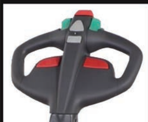
REMA Control Handle