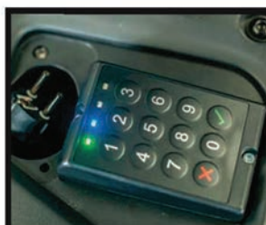
Pin Code Access Panel (OPTIONAL)