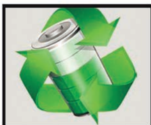
Lithium Batteries (OPTIONAL)