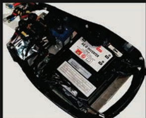
ZAPI Drive and Steering Controller